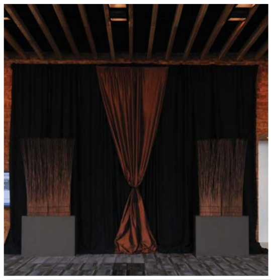
Chocolate Pintuck Drape Swag Ea. $40.00 4’w x 20’h

Pair wall treatments, bars, and sculptural elements to existing linens, graphics, branded content, or architectural features.