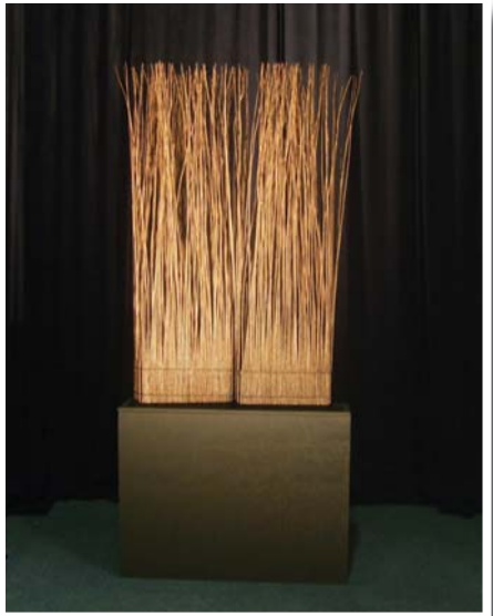
Willow Display Planters Ea. $100.00 48”w x 11”d x 36”h (Planter size)