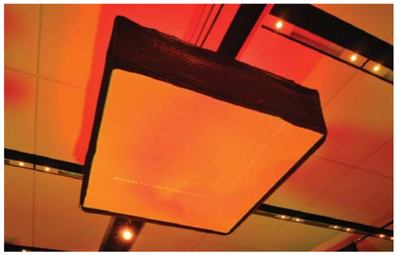
Chandeliers Frame ea. $200.00 6’w x 6’d x 2’h Ch Pintuck Wrap ea. $50.00 (Does Not include lighting)